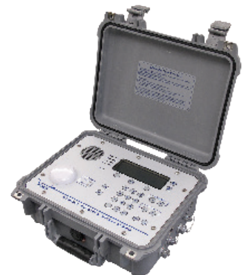
VR100 Deck Box