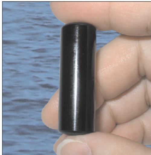
The V13 transmitter.

The V13 continuous transmitter is a 13mm diameter tag developed to provide researchers with the means to track and determine the behaviour patterns of small and juvenile fish. The V13 can function as a simple pinger for location only or for more detailed analysis, it can be equipped with a depth and/or temperature sensor. The V13 can be tracked using the VR100, VR28, and VR60 (with Option 07) receivers, or the VRAP system.