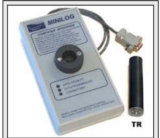
The Minilog 12 is used in a marine environment to collect temperature data for aquatic animal behaviour monitoring purposes.

The Minilog12 has no external electrical connections that could leak and users typically experience five years of battery life.